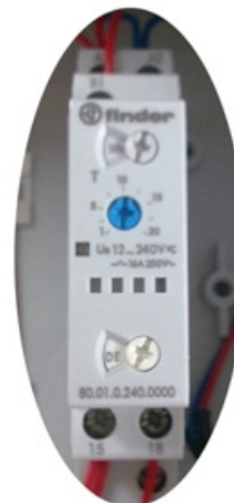
Multi range timer